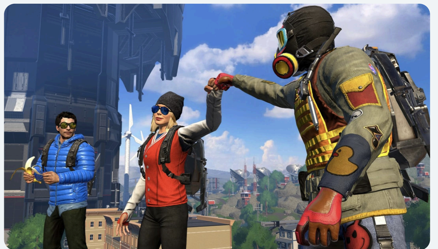
An example of a VR experience from the Population: One app