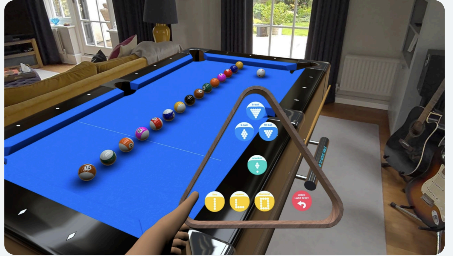
An example of an MR experience in the Miracle Pool app