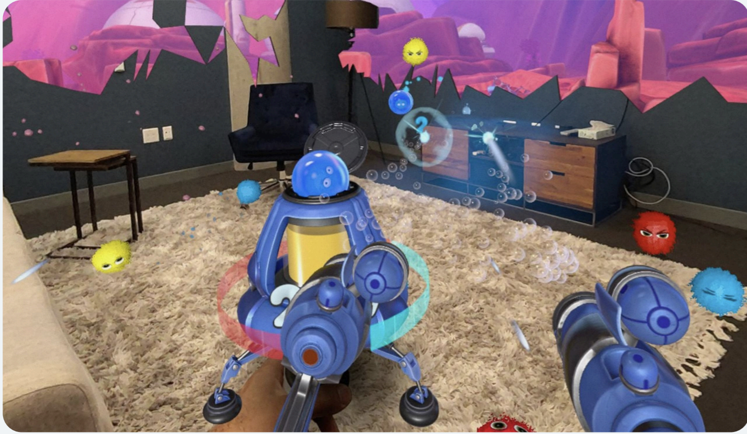
An example of an MR experience in the First Encounters app